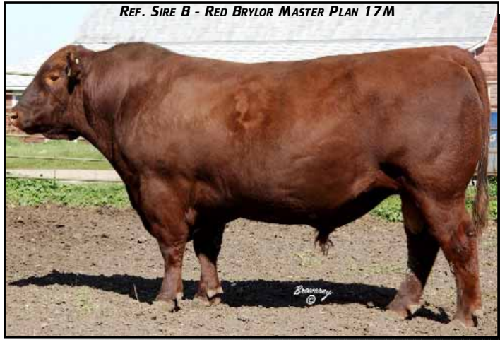
REF. SIRE B - RED BRYLOR MASTER PLAN 17M

He just keeps getting better, his progeny keep producing better and the demand for him keeps increasing especially in the U.S. (but... no more semen on him down there!). In the recent "Tradition With A Vision" 2005, five daughters averaged $4940. He truly is "the bull who does nothing wrong!".