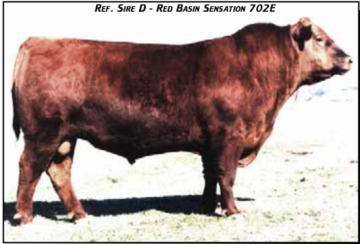
REF. SIRE D - RED BASIN SENSATION 702E

Canada's highest selling bull at $92,000! Red Rock/Beiseker bought 1/3 for $42,000 and 10 shares sold for $50,000 in 2003. His first daughters topped "Tradition With A Vision" at $12,000 for a bred heifer to Walnut/Colay in the U.S. and a heifer calf at $5100 to Papa Jack. He just may be the best breeding bull Brylor has ever let go!