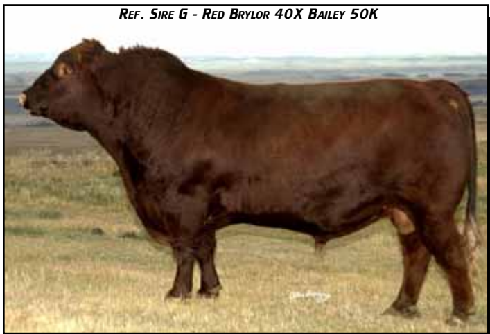
REF. SIRE G - RED BRYLOR 40X BAILEY 50K

Since selling here at the Olds "All A.I.'ed" Sale two years ago, this impressive, easy fleshing, athletic herd bull has become the lead sire at Bar 5 in Ontario. He sold for $41,000 to a group of breeders and recently Bar 5 & Brylor purchased their interests. One of his first daughters produced a calf that sold to Swan Creek for $5100 in "Autumn Colours" 2005. A flush in a daughter sold for $3500 to Ringstead.