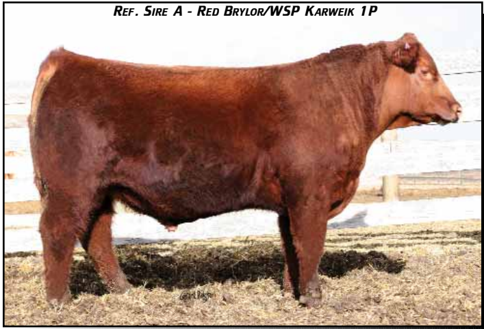
REF. SIRE A - RED BRYLOR/WSP KARWEIK 1P