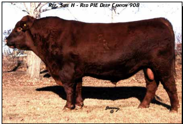
REF. SIRE H - RED PIE DEEP CANYON 908

Since being Brylor's first syndicated bull in 2001 at $67,200, he has been the replacement for his grand old man, Dynastar. The Bailey daughters are doing a good job and get back in calf very easily. He does it all so well and we don't have to rely on saying that "40X" is his full sister to promote him anymore!