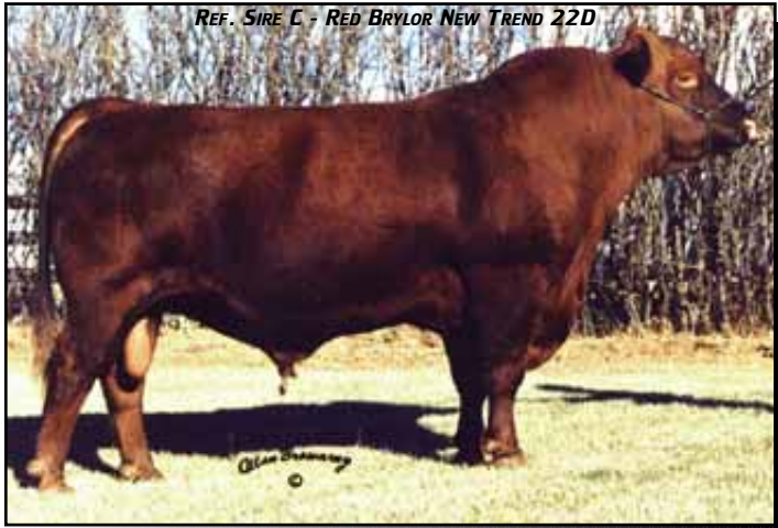
REF. SIRE C - RED BRYLOR NEW TREND 22D