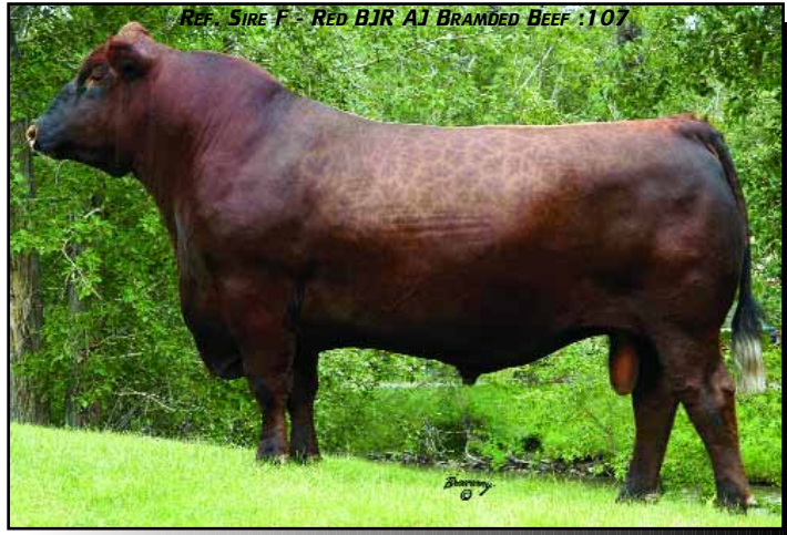
REF. SIRE F - RED BJR AH BRANDED BEEF L107

I wrote in the 2005 Brylor Semen Sales Directory in January that we could take comfort knowing that "only the good die young". There's no comfort involved when you see how good they are - his first two daughters to sell in "Tradition With A Vision" 2005 averaged $5550 and now just wait until his first sons light up the ring this spring! He sires amazing muscle and growth combined with gorgeous eye appealing calves. He will be very rare soon!